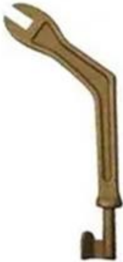
Gas Shut off (smaller tool can attached to meter)

These tools are all about a foot long. There are also inexpensive, much smaller tools, however they don't give you much leverage and this can be an issue if the valve is hard to turn.