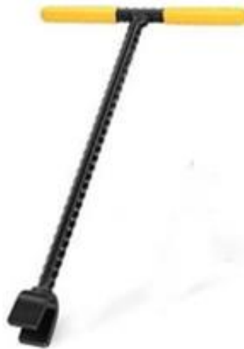
Water Shut off